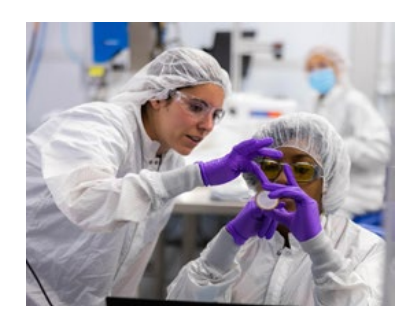
We chase excellence — we take calculated risks, learn from both success and failure and continuously improve — all at the highest level of personal integrity and ethics.